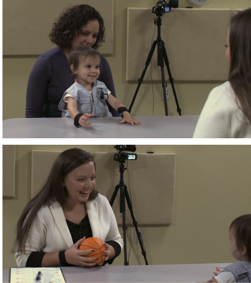
Figure 1. Child and examiner camera views in the MMDB dataset

is a child-friendly 300-square foot laboratory space which is equipped with the following sensing capabilities: